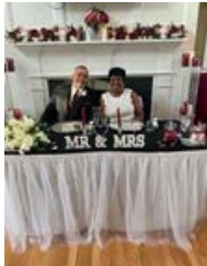
Neighbor's wedding reception in the Clubhouse in November